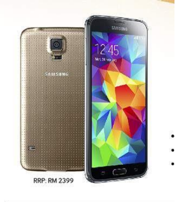
Figure 3. Display1: Explicit/Congruent