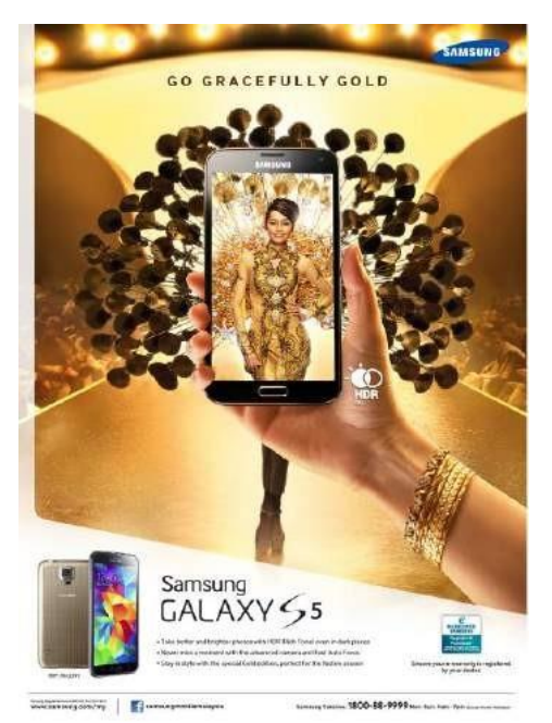
Figure 1. Samsung Galaxy S5 Advertisement

Below is the image of the print advertisement taken from google