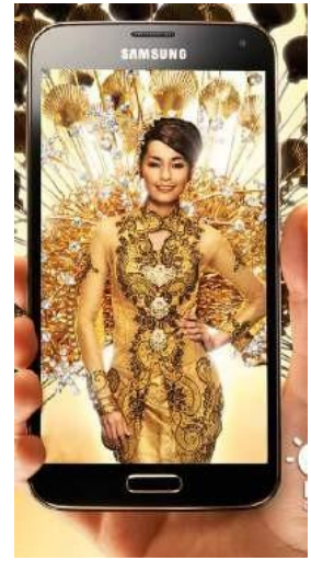
Figure 2. The Lead: Display

Visually, lead is a part of the main point due to its size, position, and/or color. Lead has the greatest potential for meaning preservation. The Locus of Attention (LoA) is divided into two parts: the Locus of Attention (LoA) and the Complement to the Locus of Attention (Comp.LoA) (Cheong, 2004: 165). LoA: exhibition of demand is depicted in the advertising above. It means that the model in the photograph appears to be looking directly at the viewers/audience. We will feel that the model is always looking at us if we are in that position, and we will beable to develop an intimate relationship between the audience and the object in theimage/picture if we are in that position. The model in the advertising is likewise delighted, as evidenced by her smiling face, which reveals her teeth. This refers to drawing the audience's/attention viewer's on a unique feature of the advertisement, such as a camera with fast auto focus that can capture better and brighter photos even in low-light situations. The advertisement's color scheme is really fashionable. The gold color was chosen to convey to viewers that whatever images are shot withthis camera, the end result will be amazing, just like real gold. This advertisement shows additional display in order to attract the attention of the viewers, as evidenced by the various color alternatives provided, so that the viewer/customer has a variety possibilities in selecting their favorite color