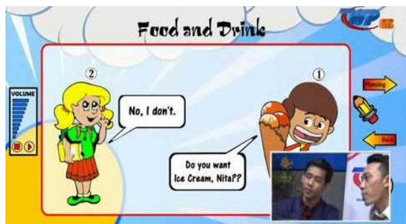
Picture 2. Conversation picture

The third step is to analyze the compositional meta-function in the English conversation picture which can be used as a medium for learning about English conversation.