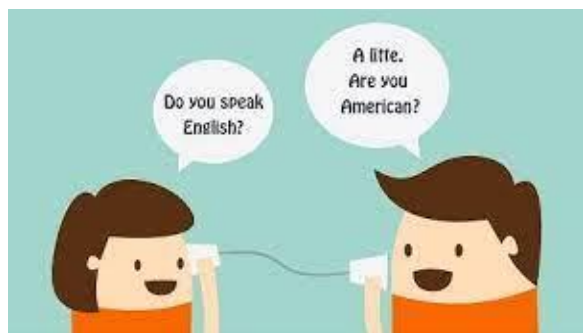
Picture 1. Animated form of English conversation

The first step is to analyze the representational metafunction of the image presented using an animated form containing conversation in English as a medium for learning English.