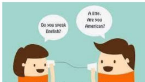
Picture 1. Animated form of English conversation

The first step is to analyze the representational metafunction of the image presented using an animated form containing conversation in English as a medium for learning English.