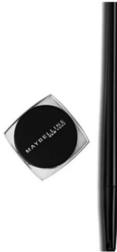
Figure 1. Maybelline New York's Gel Pencil beauty cosmetic.

From the example above, the researcher can see that the problem with the Maybelline gel pencil New York advertisement is that there is no delivery or instructions on how to use it. Based on the example above, we can clearly see the types of interpersonal meaning of the Maybelline gel pencil New York advertisement (Tables 1-4).