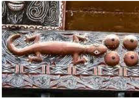
Figure 1. Lizard (Boras Pati)